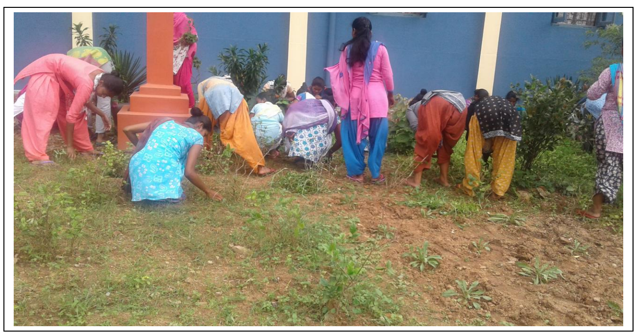
PRINCIPAL URSULINE WOMEN'S TEACHERS' TRAINING COLLEGE LOHARDAGA, JHARKHAND-835302