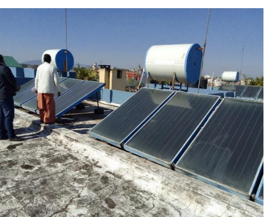
2. Photos: Solar Energy and Conservation