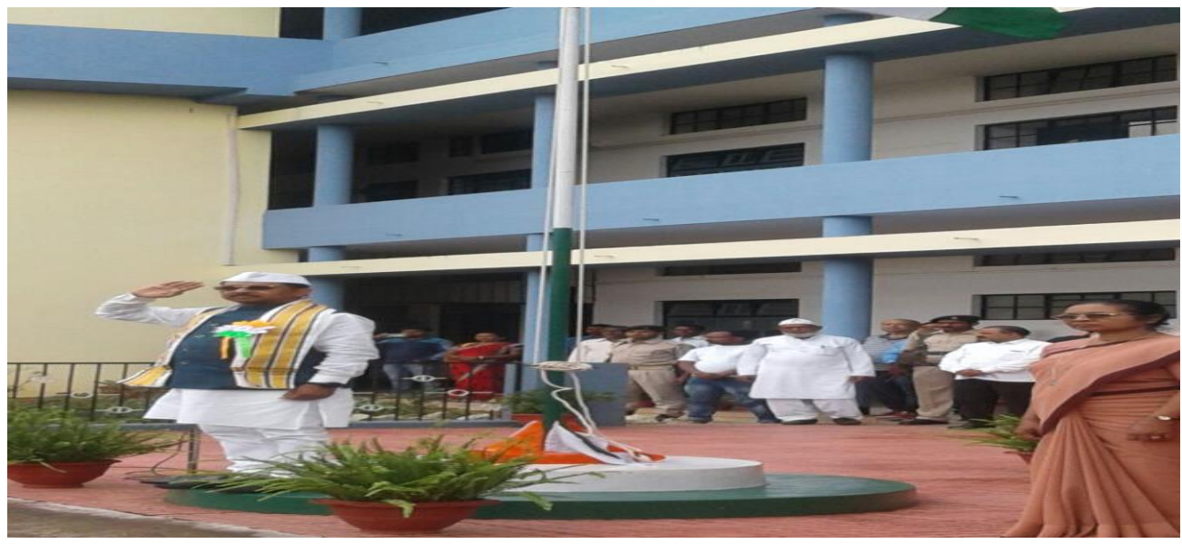
Sv Shila-PRINCIPAL URSULINE WOMEN'S TEACHERS' TRAINING COLLEGE LOHARDAGA, JHARKHAND-835302