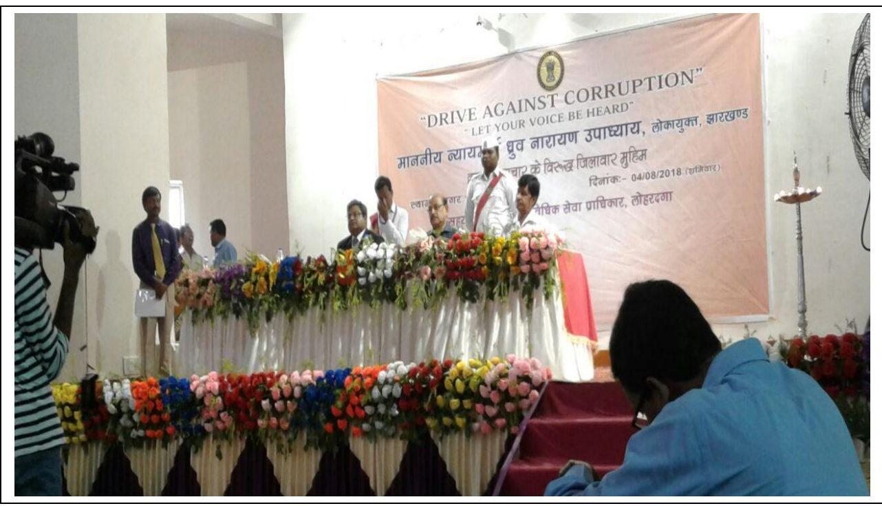
PRINCIPAL URSULINE WOMEN'S TEACHERS' TRAINING COLLEGE LOHARDAGA, JHARKHAND-835302