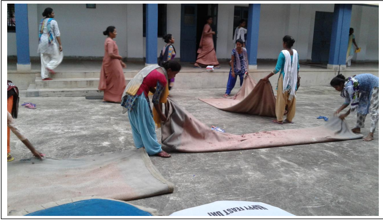
PRINCIPAL URSULINE WOMEN'S TEACHERS' TRAINING COLLEGE LOHARDAGA, JHARKHAND-835302