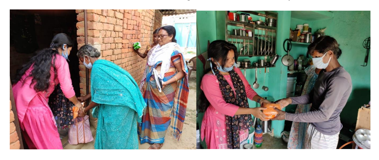
Sv Shila-PRINCIPAL URSULINE WOMEN'S TEACHERS' TRAINING COLLEGE LOHARDAGA, JHARKHAND-835302