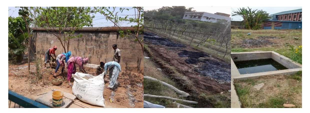
4. Photos: Waste Management